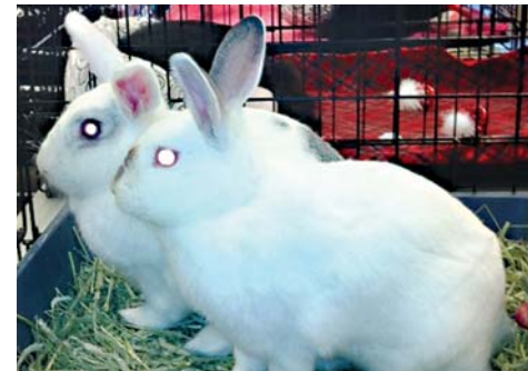
Daisy and her sister Lily

information and to see our other kitties, please check our website at www.kittenrescue.org , or email us at mail@kittenrescue.org . Your tax-deductible donations for the rescue and