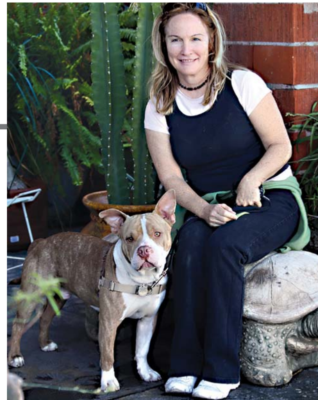
Ruckus, happy forever.

When you adopt a “pet without a partner,” you will forever make a difference in their life and they are sure to make a difference in yours. •